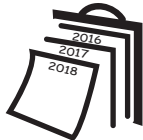
End of Year Breakdown

Ark Cat Sanctuary worked in concert with Coconino Humane Association to help them achieve a feline euthanasia rate of less than 7% which grants them “No-Kill” shelter status.